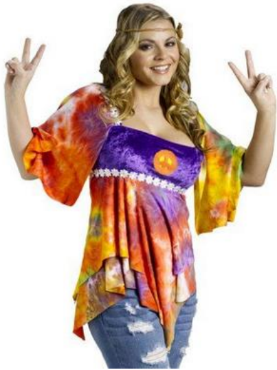
Tie-Dye Bell Bottoms Clogs

1970s: Young women began entering graduate and professional schools in larger numbers and more women began to engage in paid employment after marrying and having children. Financial independence and the ability to earn a good living are deeply intertwined with access to educational opportunities.