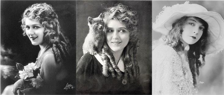
Curls and ringlets were in style, made popular by Mary Pickford and Lillian Gish. Bows, pins, headbands, and different types of hats were extremely cool as accessories.

Before the growth of high schools after 1900, most women left school after the eighth grade aged around fifteen.