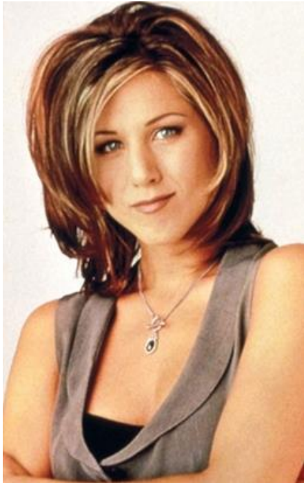
"The Rachel" Haircut